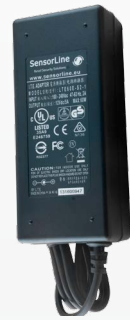
BOSSystem Power Supply 12V. For A8, TP6s, MP12s, A5, AP5, AP5s, and SL12 (when used with locks)