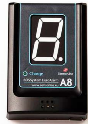
BOSSystem A8. The A8 is a touch free RFID Reader – access point – securing, controlling and gathering data from products on display.