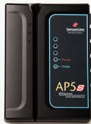
BOSSystem AP5s. All in one. RFID Reader and 5 slots for display up to 5 devices. Mix of Smartphones, tablets or all the same. Direct output to external computer for Digital Signage.