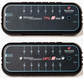
BOSSystem MP12s, TP6s. Smartphone's and Tablet extensions. Guarantee 5V and up to 2.1 A on each port. I/O port to BOSSystem BCC or direct to external Computer for Digital Signage.