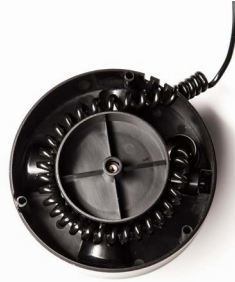
RS1 Rewinder Reel. Dia. 120 mm, H 52mm. Fix the RS1 Magnetic Lock Base and makes the display clean with no visible cables.