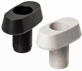
RS1 Magnetic Lock Base with threading. Black or white. For easy mounting. 22 mm hole.