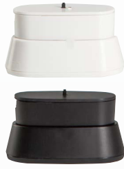
RS1 Power Sensor. Black or white. Micro Processor controlled communication with the A8. Suitable for securing and charging displayed live devices as Smart Phones, GPS or MP3 Players.