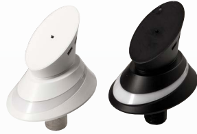
SWAN Low Profile with threading. Black with Blue/white necklace or choose color of your own with 256 RGB Color LED Ring.