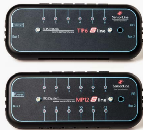
BOSSystem MPI2s, TP6s. Smartphone's and Tablet extensions. Guarantee 5V and up to 2,1 Amp on each port. I/O port to BOSSystem BCC or direct to external Computer for Digital signage.