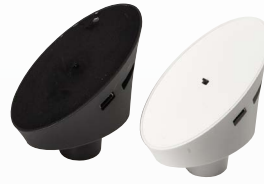
SWAN Sensor Head Black or White. Micro Processor controlled communication with the BOSSystem. Powering the Smart Phone or Tablet directly from the sensor with 5V up 2,1 Amp. Active LED light to show status of the POD.