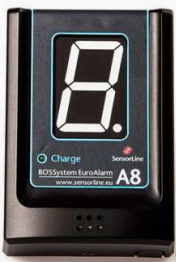
BOSSystem A8. The A8 is the touch free RFID Reader – access point – securing, controlling and gathering data from the products on display.