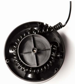
RS1 Rewinder Reel. Dia. 120 mm, H 52mm. Fix the High/low profile SWAN and makes the display clean with no visible cables