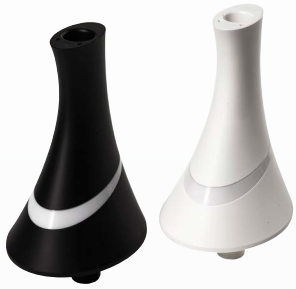
SWAN High Profile with threading. Black or White. With Blue/white necklace or choose color of your own with 256 RGB Color LED Ring.