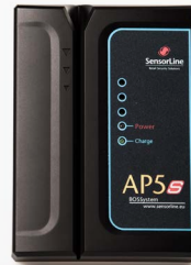
BOSSystem AP5s. All in one. RFID Reader and 5 slots for display up to 5 devices. Mix of Smartphones, tablets or all the same. Direct output to external computer for Digital Signage.